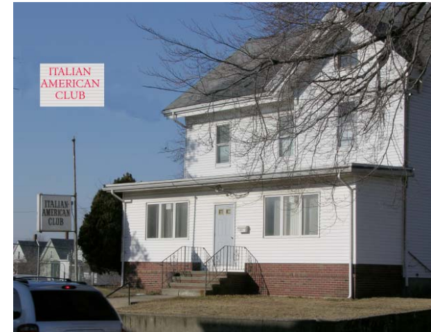
Landmark - House across from from park